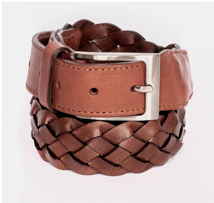
SF-3013 CASUAL BELT ALOHA