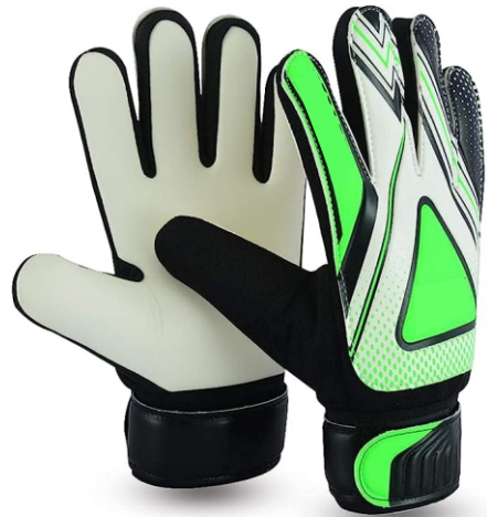
SF-3048 FootBall Gloves Kids