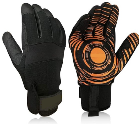
SF-3052 Anti Vibration Gloves