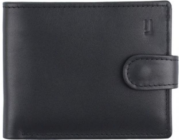
SF-3036 Cairo Wallet