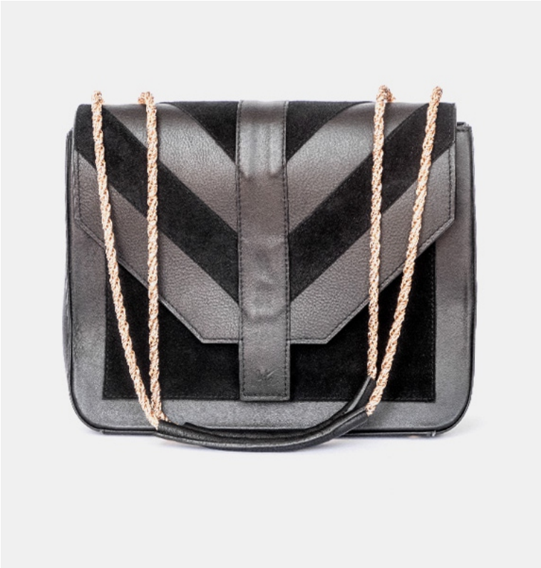
SF-3020 HANDBAG LOLITA