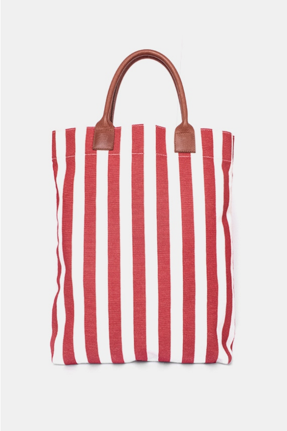
SF-3019 BAG BEACH STRIPES