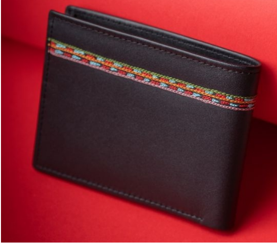
SF-3035 Harnai Wallet