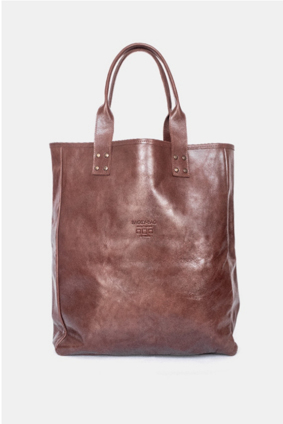
SF-3017 BAG PRINCETON