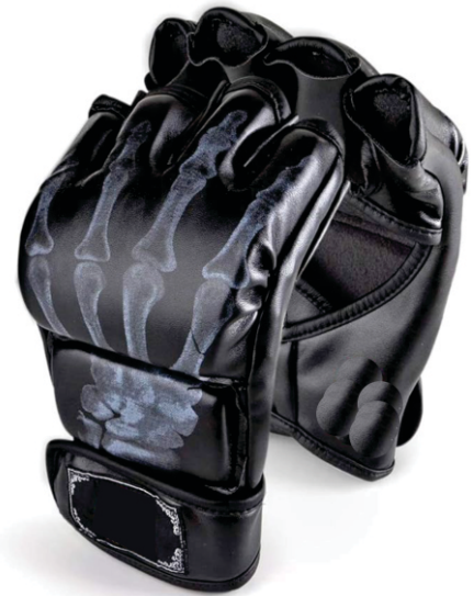
SF-3048 MMA Gloves