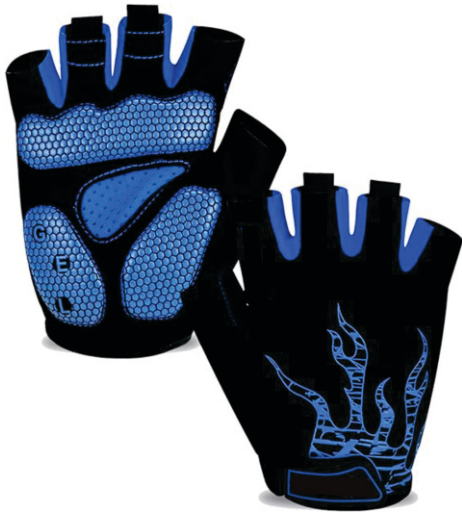
SF-3068 Cycling Gloves