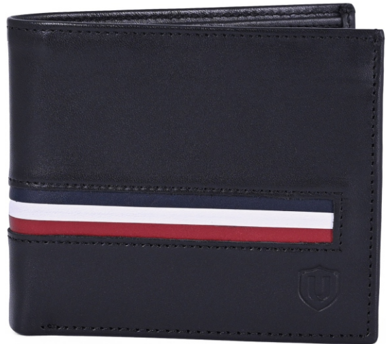
SF-3049 Leather Mens Wallet