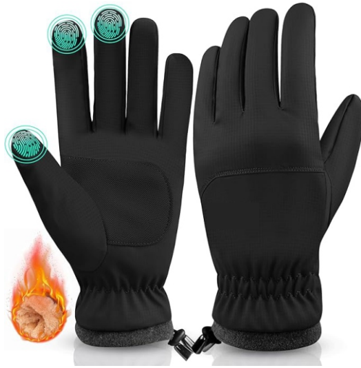
SF-3048 SKI Gloves