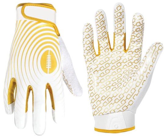
SF-3048 Foot Ball Gloves