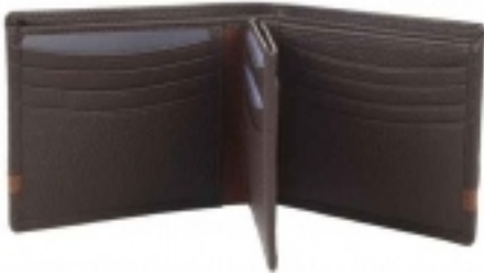
SF-3046 Leather Mens Wallet