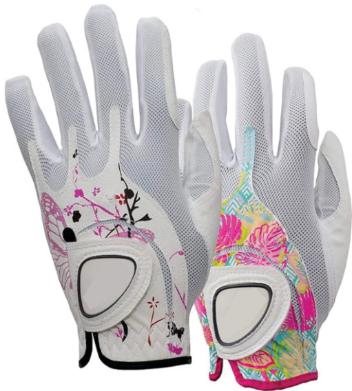
SF-3048 Women Golf Gloves