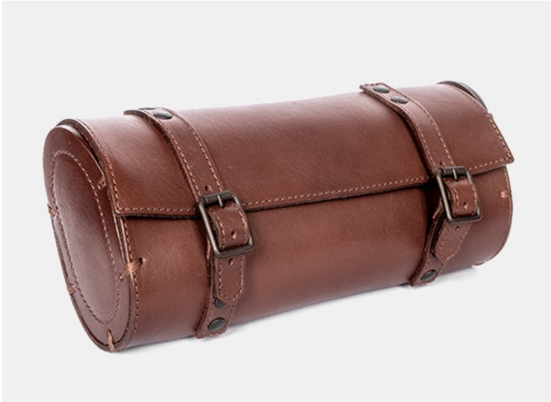
SF-3014 CASUAL BELT BALI