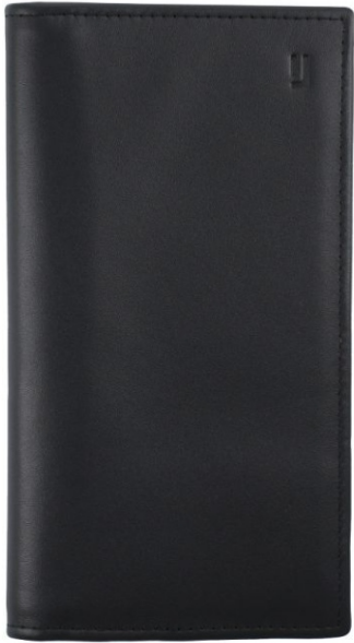
SF-3034 Ankara Wallet