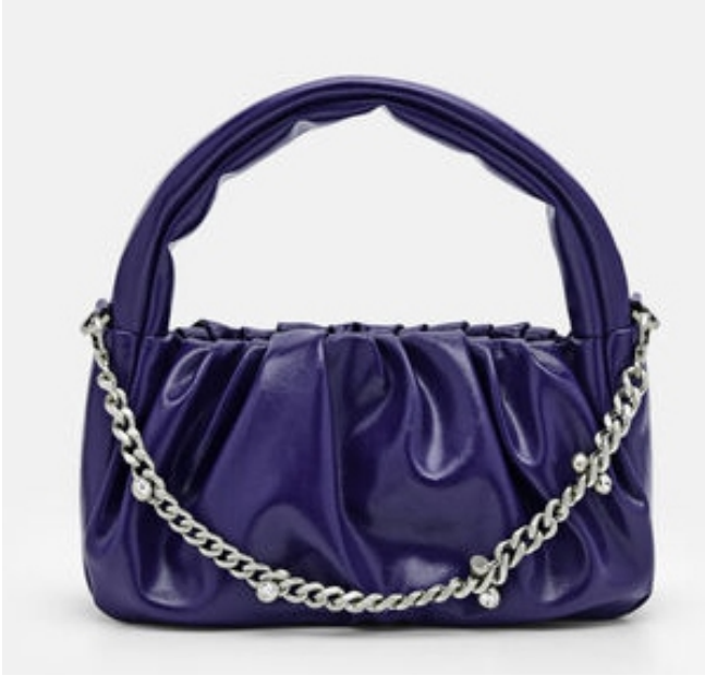
SF-3029 Cami Mini Shoulder Bag