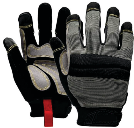
SF-3063 Construction Gloves