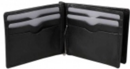
SF-3047 Leather Mens Wallet