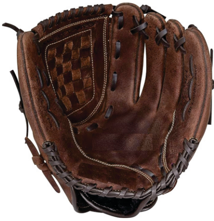
SF-3053 Base Ball Gloves