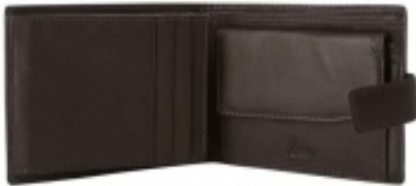
SF-3042 Leather Mens Wallet