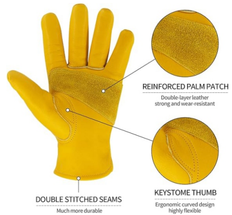
SF-3048 Gardening Gloves