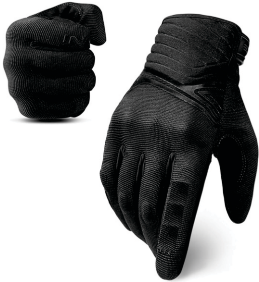
SF-3048 Motorcycle Gloves