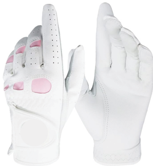
SF-3049 Women Golf Gloves