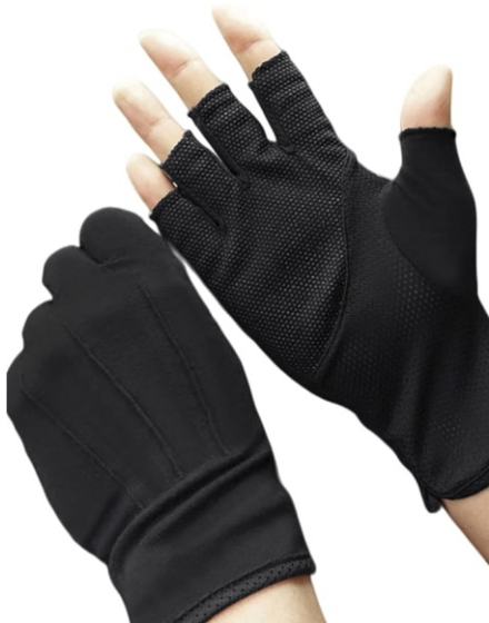
SF-3048 Driving Gloves