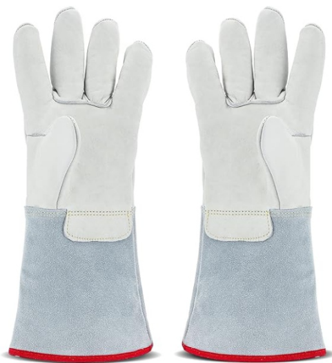
SF-3067 Cryogenic Gloves