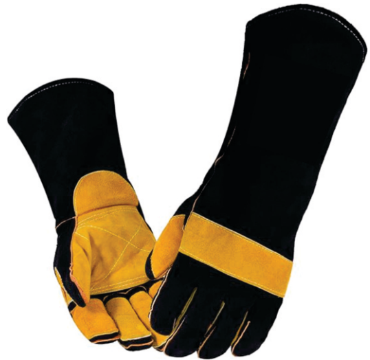
SF-3048 Welding Gloves