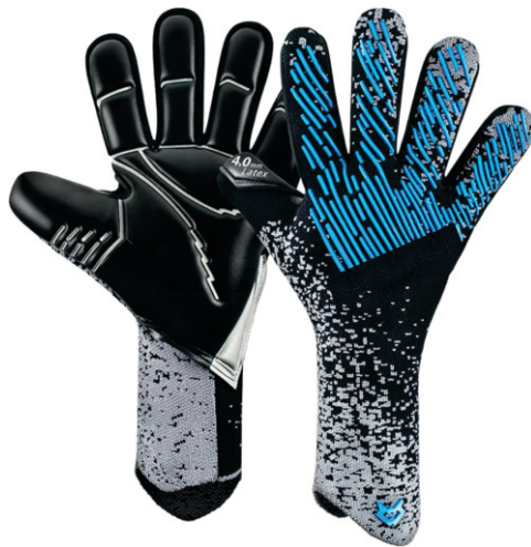
SF-3049 FootBall Gloves Kids