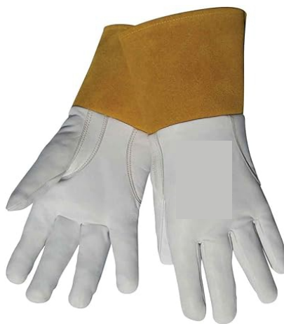
SF-3049 Welding Gloves