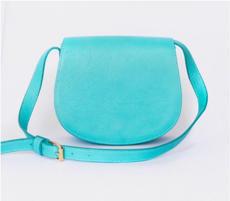
SF-3018 HANDBAG VIENA