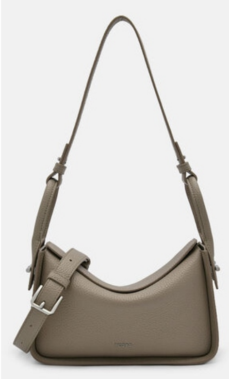
SF-3028 Demi Leather Shoulder Bag