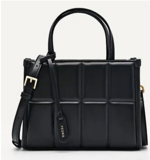
SF-3026 Mini Quilted Handbag