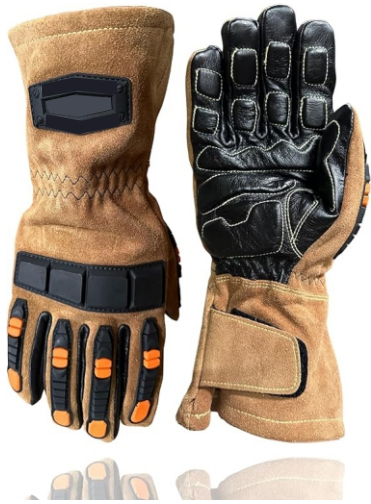
SF-3050 Anti Vibration Gloves