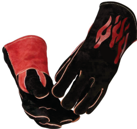
SF-3049 Tactical Gloves