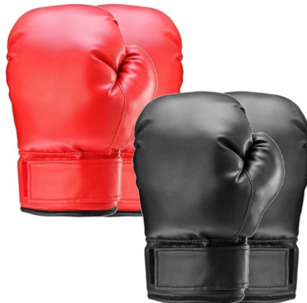
SF-3061 Boxing Gloves