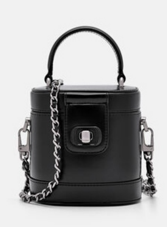
SF-3027 Nica Mini Shoulder Bag