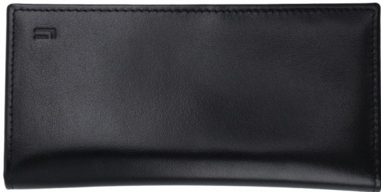
SF-3037 Las Vegas Wallet