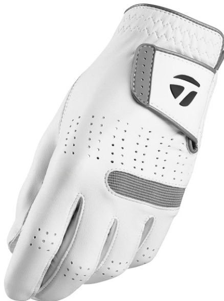
SF-3049 Golf Gloves