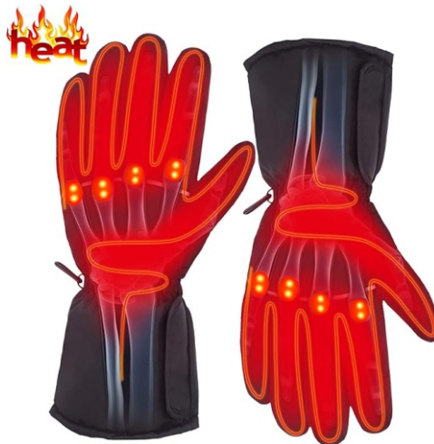
SF-3049 Heated Gloves