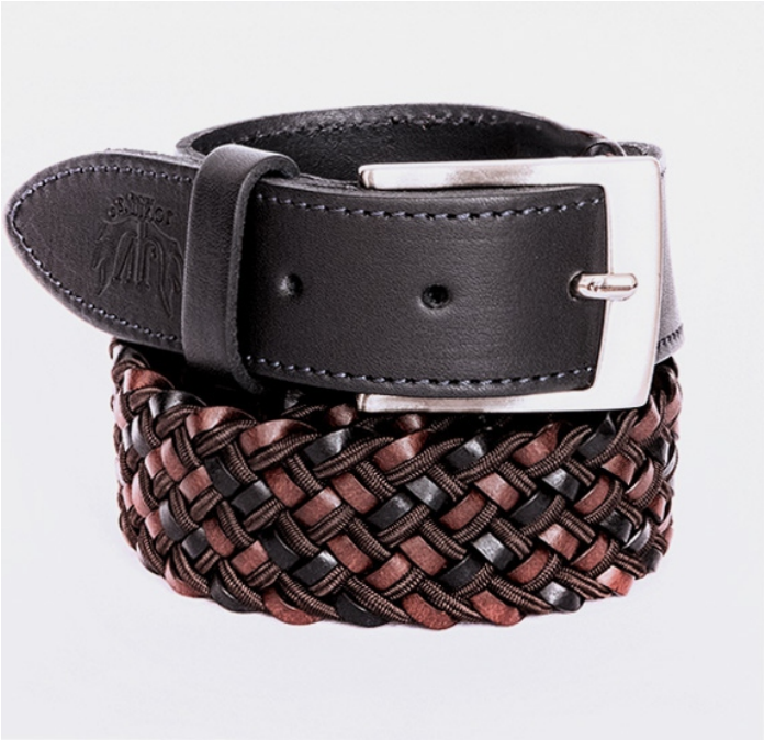
SF-3011 CASUAL BELT BALI