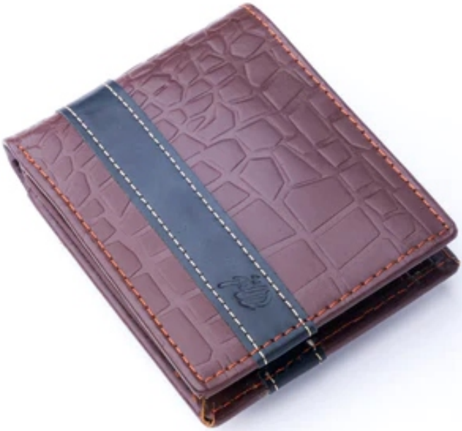
SF-3039 Leather Mens Wallet