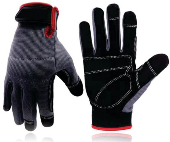
SF-3048 Work Gloves