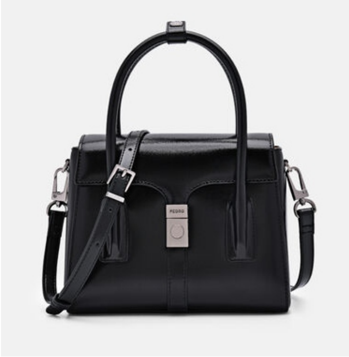
SF-3023 Leather Compact HandBag