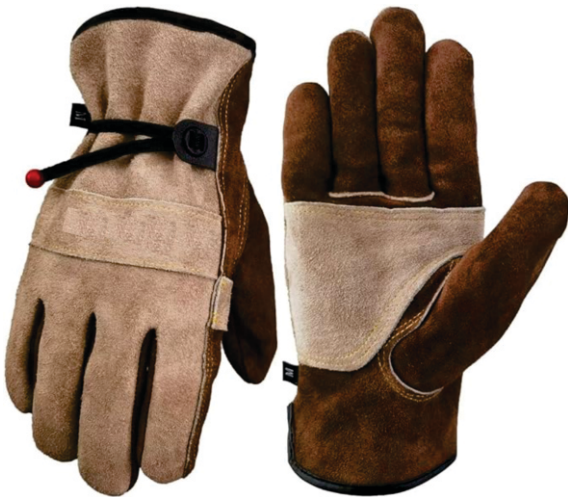
SF-3048 Welding Gloves