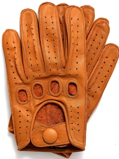
SF-3049 Driving Gloves