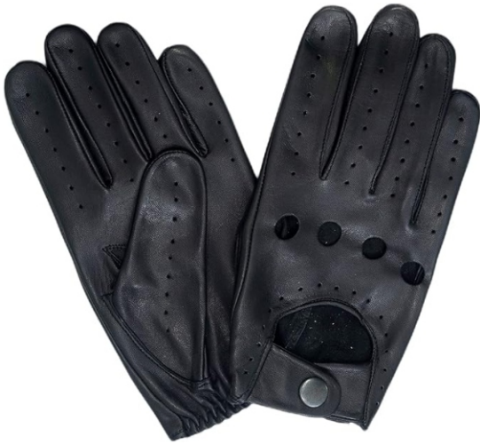
SF-3048 Driving Gloves