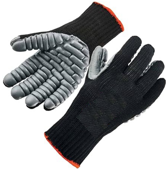
SF-3051 Anti Vibration Gloves