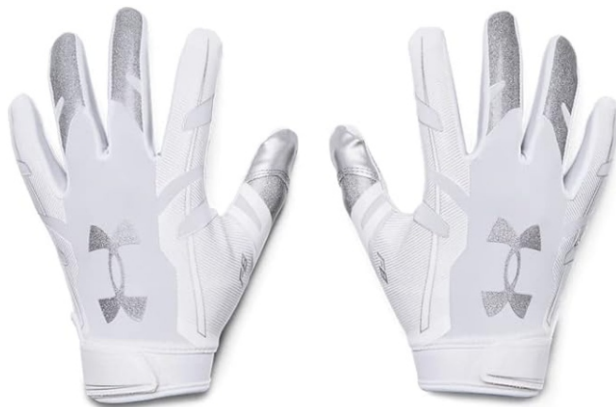
SF-3049 Foot Ball Gloves