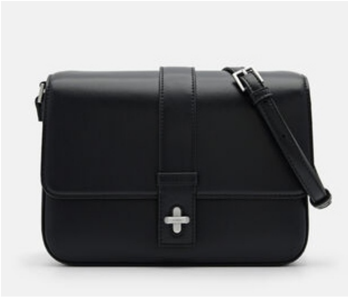
SF-3024 Brie Shoulder Bag