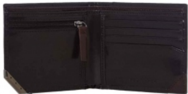
SF-3045 Leather Mens Wallet