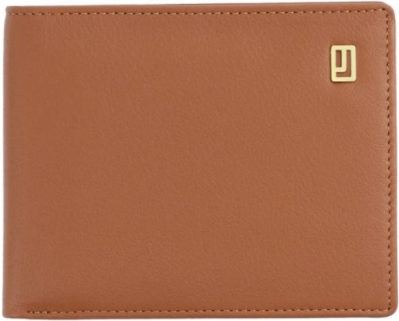
SF-3038 Queenstone Wallet