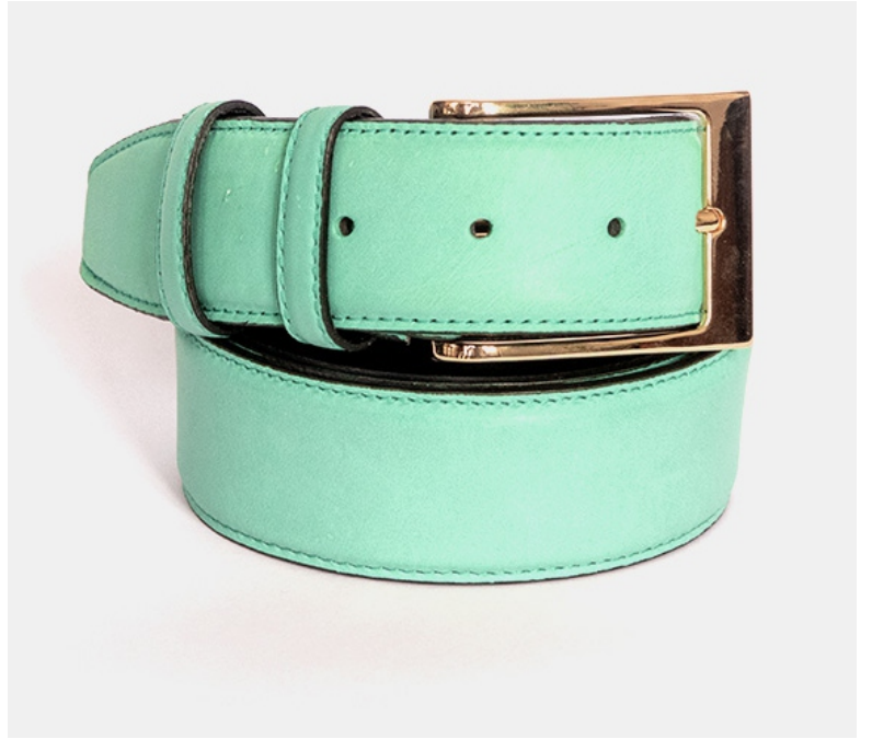
SF-3012 CASUAL BELT LEAF