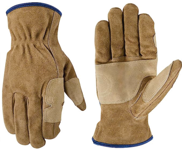
SF-3048 Work Gloves