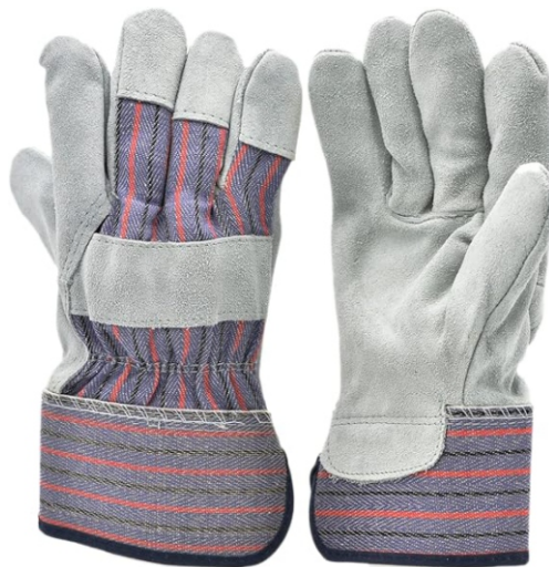
SF-3049 Work Gloves