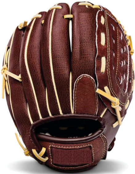
SF-3055 Base Ball Gloves