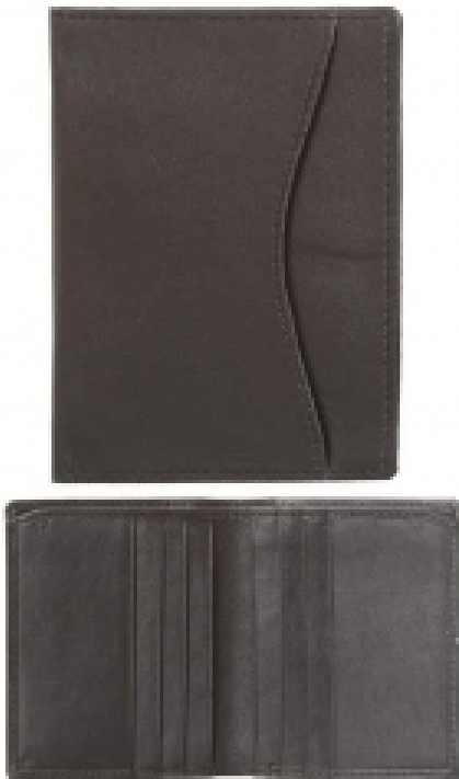
SF-3044 Leather Mens Wallet