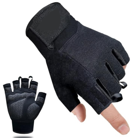
SF-3069 Cycling Gloves