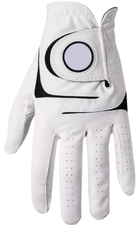
SF-3048 Golf Gloves