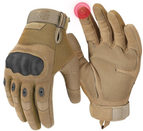
SF-3048 Tactical Gloves