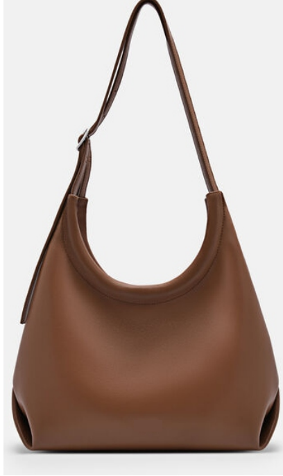
SF-3025 Naomie Hobo Bag