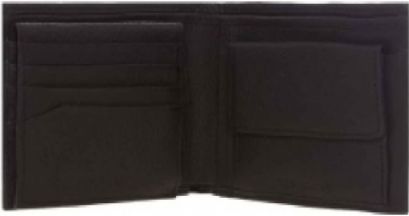
SF-3048 Leather Mens Wallet