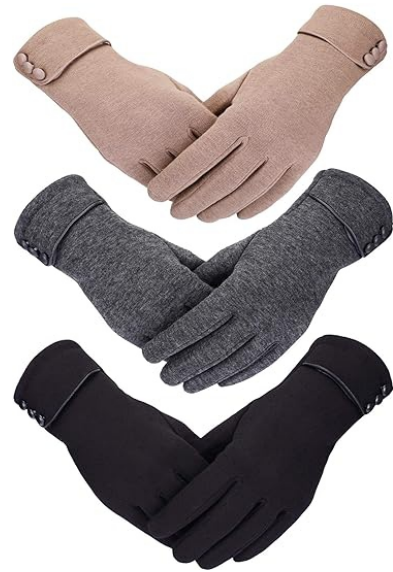
SF-3048 Winter Gloves