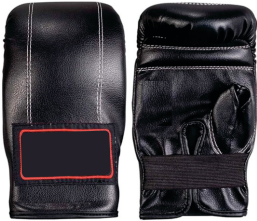
SF-3059 Boxing Gloves