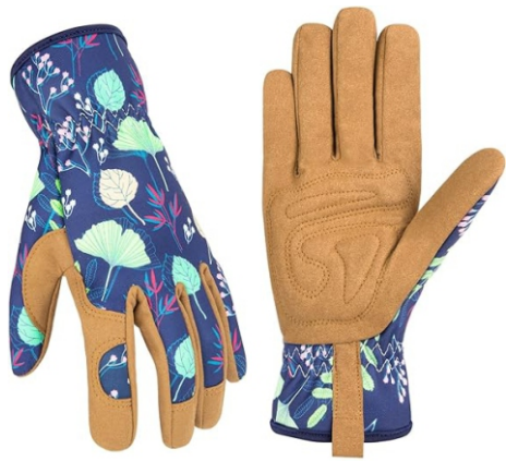
SF-3048 Gardening Gloves