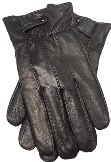
SF-3049 Winter Gloves