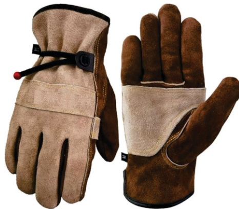
SF-3064 Construction Gloves