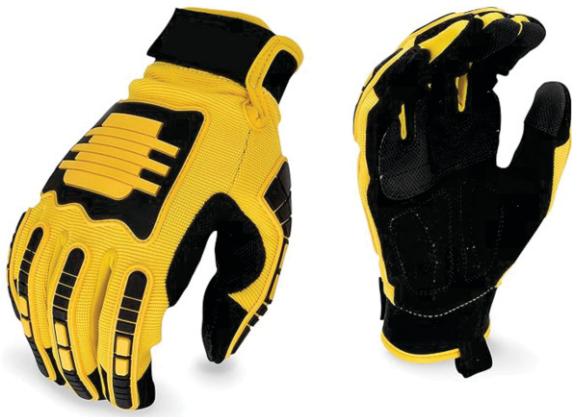
SF-3062 Construction Gloves