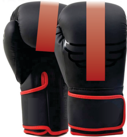
SF-3060 Boxing Gloves