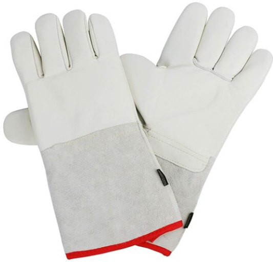
SF-3065 Cryogenic Gloves