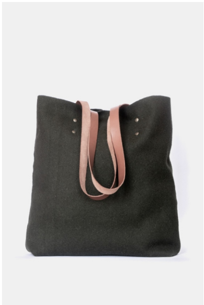
SF-3016 CASUAL BELT ALOHA