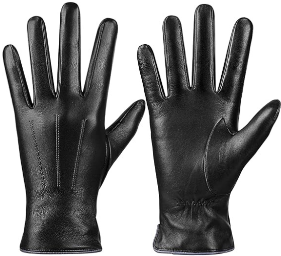
SF-3048 Winter Gloves