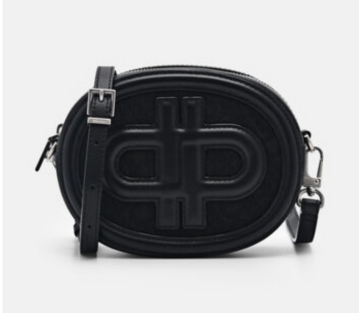
SF-3030 Icon Round Leather Shoulder Bag