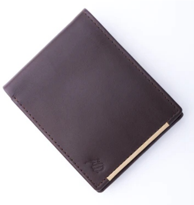
SF-3040 Mens Pure Leather Wallet Bifold Brown Strip