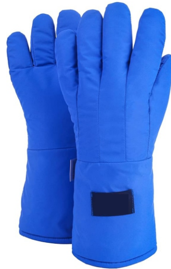
SF-3066 Cryogenic Gloves