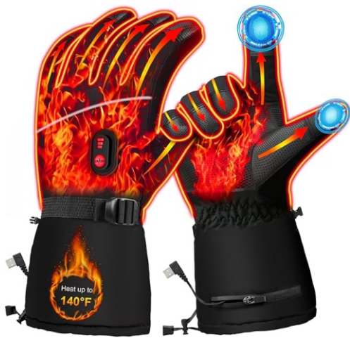
SF-3048 Heated Gloves