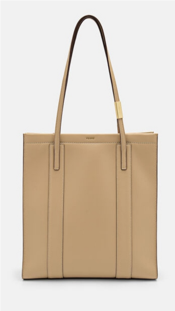
SF-3022 Izzie Tote Bag