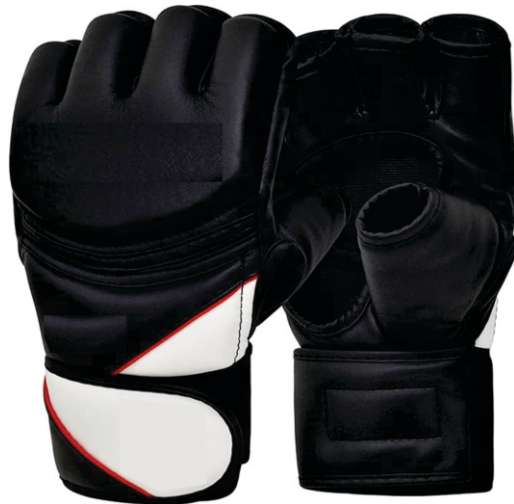
SF-3049 MMA Gloves