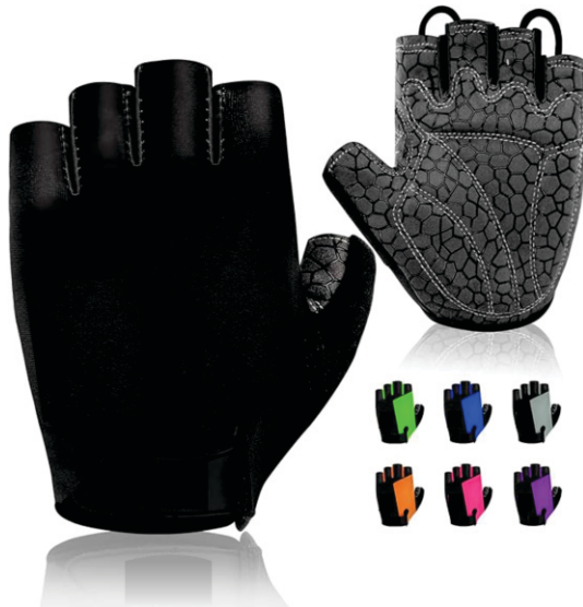
SF-3070 Cycling Gloves