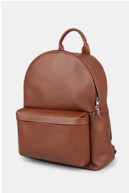
SF-3015 CASUAL BELT ALOHA