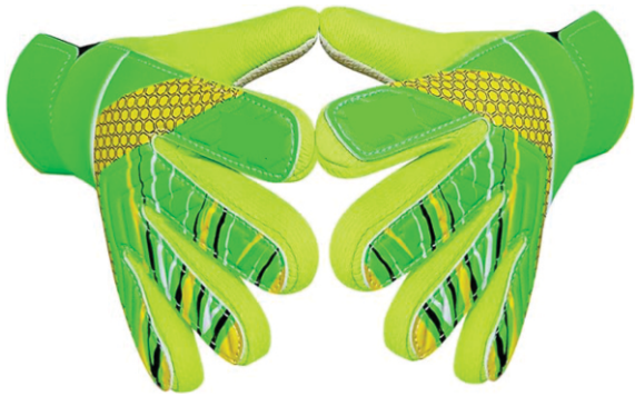
SF-3048 FootBall Gloves Kids