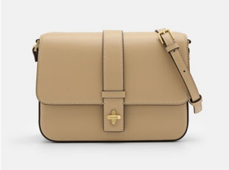
SF-3021 Brie Shoulder Bag