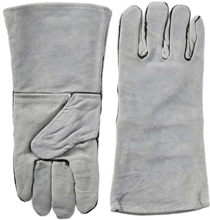
SF-3048 Tactical Gloves