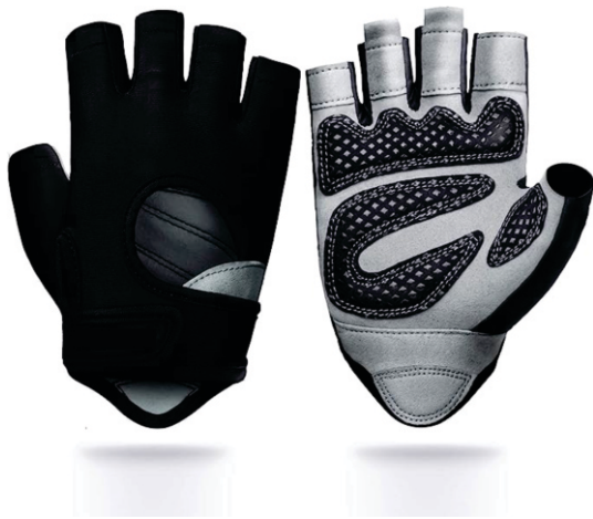
SF-3048 Foot Ball Gloves