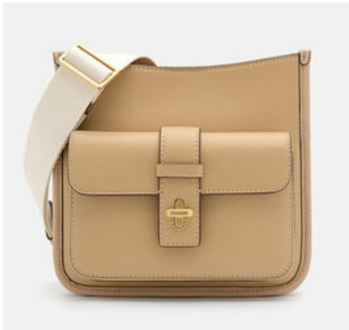
SF-3031 Brie Square Shoulder Bag