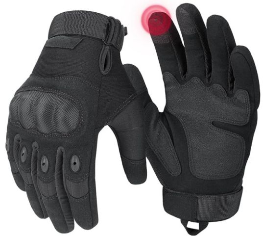
SF-3048 Motorcycle Gloves

ELASTIC FIT, FINGERS BEND AND STRETCH FREELY