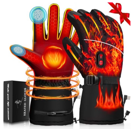
SF-3048 Heated Gloves