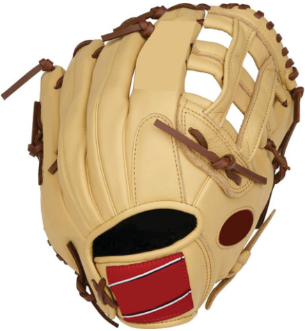
SF-3054 Base Ball Gloves