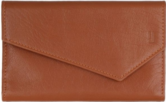
SF-3033 Orbit Travel Wallet