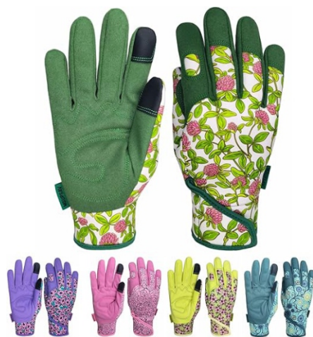
SF-3049 Gardening Gloves