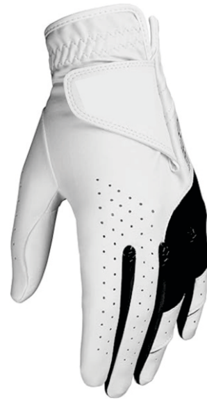
SF-3048 Women Golf Gloves