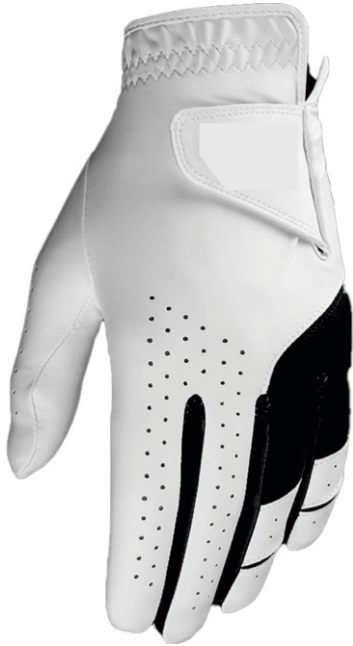
SF-3048 Golf Gloves