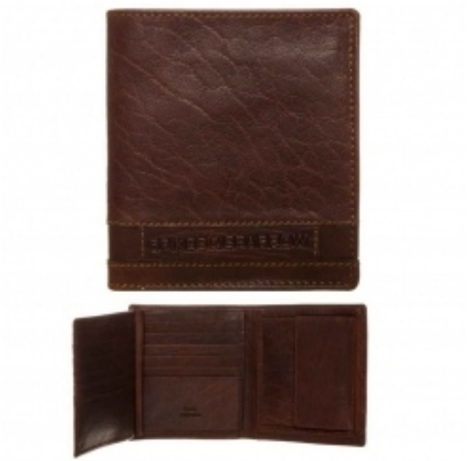
SF-3041 Leather Mens Wallet