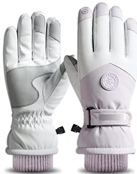
SF-3049 SKI Gloves