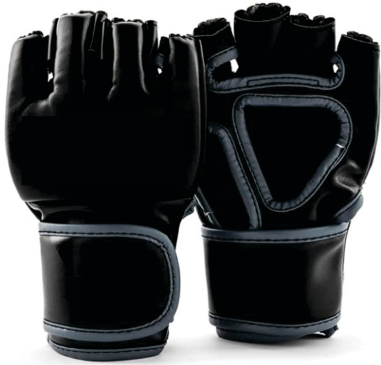
SF-3048 MMA Gloves