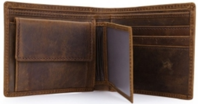
SF-3043 Leather Mens Wallet